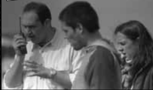
*People without legal papers in the heart of a short feature