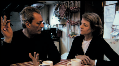
BROOKLYN / PAUL AUSTER / FEBRUARY 2009