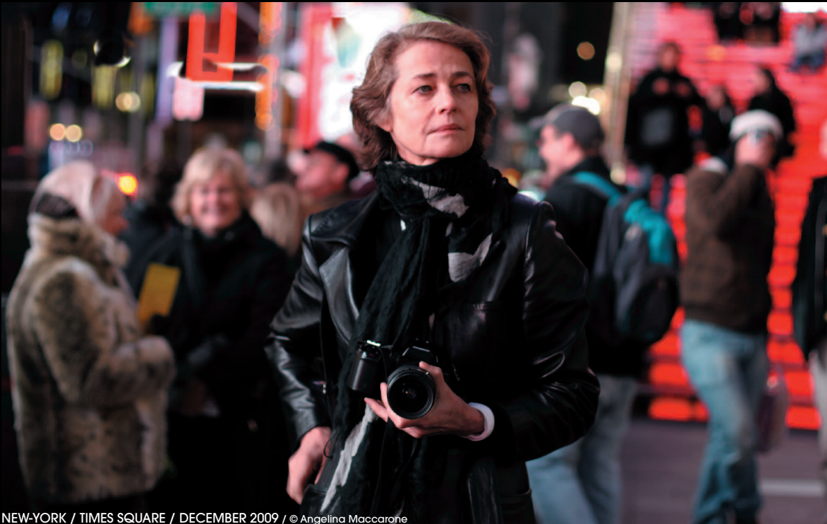
NEW-YORK / TIMES SQUARE / DECEMBER 2009

Breaker of taboos, icon avant-gardist – to capture the persona Rampling is a cinematic adventure that can only succeed by being as brave as she has been throughout her career. Staged in countless films and photographs as the classic “object of desire”, THE LOOK takes on her perspective, we see the world through her eyes. Far beyond anecdotic trivia or linear biography Rampling fearlessly fathoms the major questions of life with companions, soul mates such as Peter Lindbergh and Paul Auster.