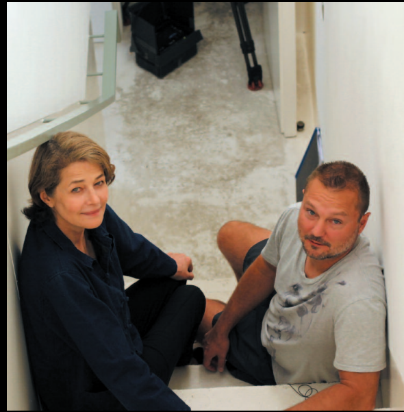
LONDON / JUERGEN TELLER STUDIO / 2010 / © Angelina Maccarone