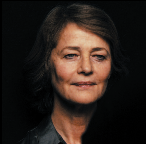
PARIS / PHOTO DURING THE SHOOT / PETER LINDBERGH / 2008