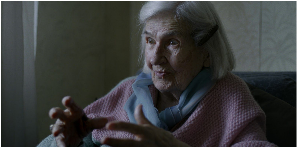
Sonja in Landscapes of Resistance