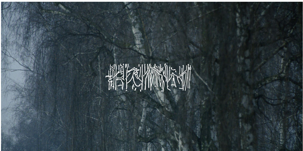
Stills from Landscapes of Resistance