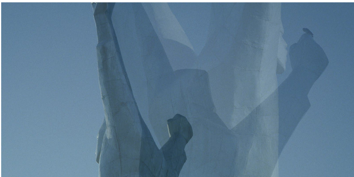
Still from Landscapes of Resistance