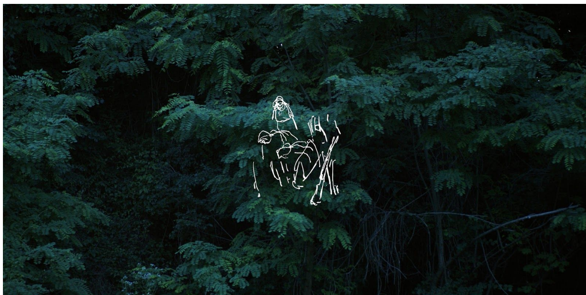
Still from Landscapes of Resistance

Bocalupo Films Jasmina Sijerčić jasmina@bocalupofilms.com +33 6 59 24 64 43