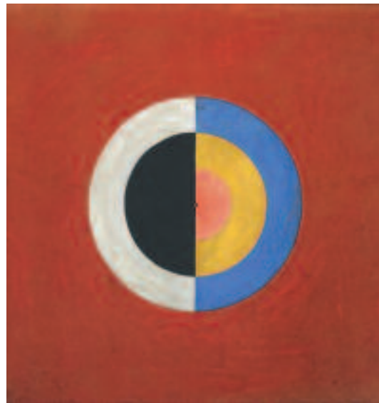
The Swan No 17-1915

H ilma af Klint (1862-1944) can be counted among the greatest artists of the 20 th century, and was a pioneer of abstract art several years before Kandinsky, Mondrian or Malevich. She was also one of the rare female artists of her generation to have as radical an approach to her creativity. As early as 1906, Hilma af Klint broke away from figurative painting after being influenced by spiritualism and theosophy. Through her art, she tried to grasp undiscovered dimensions beyond tangible reality. Along with other pioneers of abstraction, she shared a fascination for the occult and the spiritual dimensions art, all of which is manifested in her powerful and enigmatic compositions. As a medium, she was convinced her works were dictated to her from the Hereafter. "The pictures were painted directly through me without preliminary drawings and with great power. I had no idea what the pictures would depict. And, still, I worked quickly and surely without changing a single brush stroke." Despite the fact that Hilma af Klint's body of work includes over one thousand paintings and sketches, she has remained largely unknown. Because she felt they were too audacious, her abstract paintings were never exhibited during her lifetime. Klint's last will and testament imposed a twenty year waiting period after her death before they could be shown, since she was convinced they could not be understood