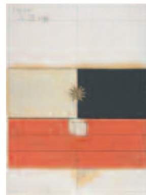
No 3b, Série IV 1920