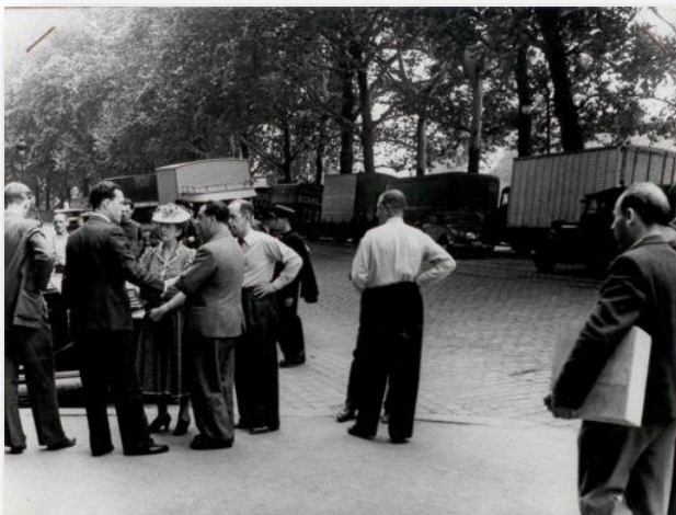
Jaujard supervises evacuation