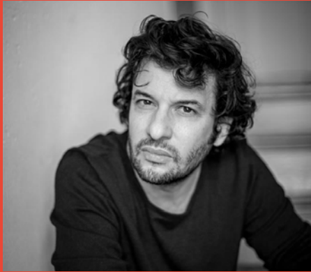
Eric Caravaca Gilles