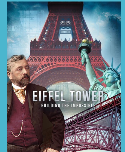
Eiffel Tower: Building the Impossible