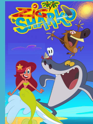
Zig & Sharko