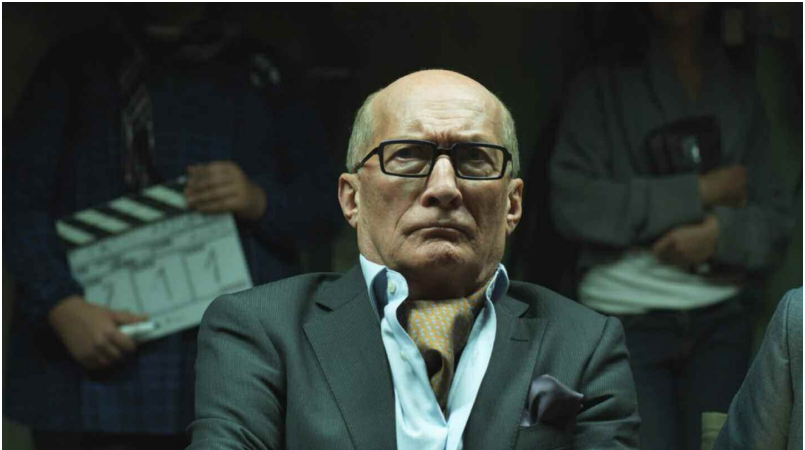
Head of Film School