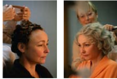
1ST SERIES OF TESTS