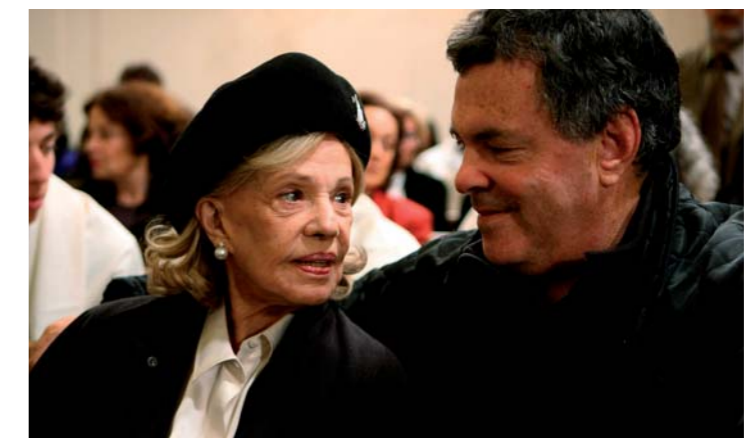
Jeanne Moreau and Amos Gitai

The film ends with a scene of the government's actions to financially repair the damage done to the living family members of Vichy France victims, a wound which won't heal.